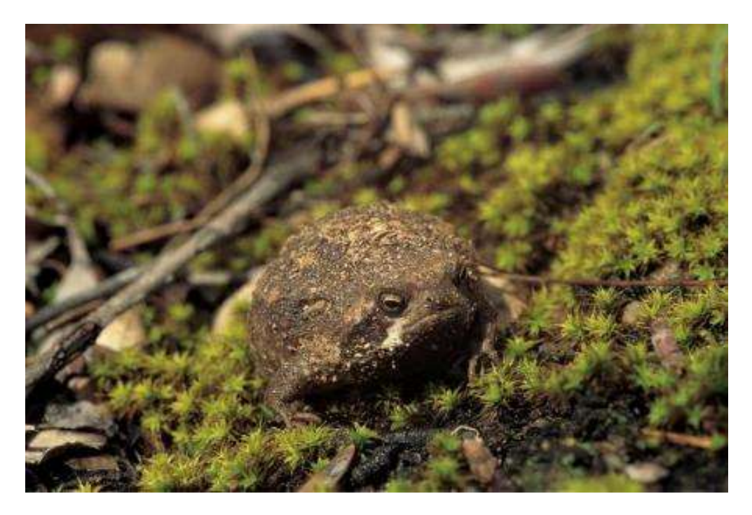
Figure 3: The Cape Rain Frog Breviceps gibbosus

The main campus has a population of threatened frogs, the Cape Rain Frog, a burrowing species with an IUCN red list<sup>15</sup> conservation status of Near Threatened. The main threats are habitat loss though urban sprawl. A baseline distribution survey<sup>16</sup> of these frogs on middle campus was undertaken in 2009, during the construction of new buildings in the area. The study found that the population is conservation-worthy with an adult population estimated at ~320 individuals that would remain viable if the habitat was well managed as per recommendations. While the conservation of this frog is considered by the Gardens Department in terms of the timing of major garden works, the full extent of the recommendations has not been adopted or implemented. The population can be supported by avoiding further fragmentation of their habitat and landscape management to encourage expansion of the population. The recommended monitoring programme and further research to determine population trends remains to be implemented in future.