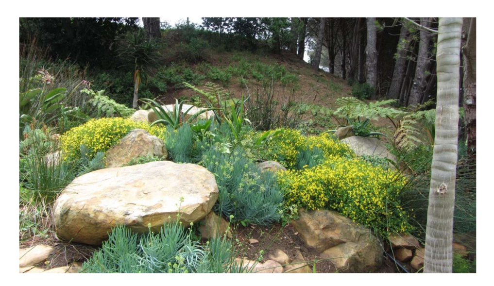
Figure 2: Indigenous planting on the embankment below P6 Parking